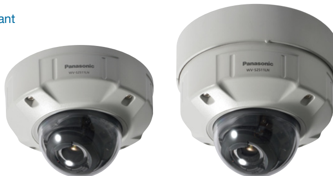
with Base Bracket